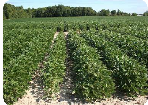
Starter fertilizer alone