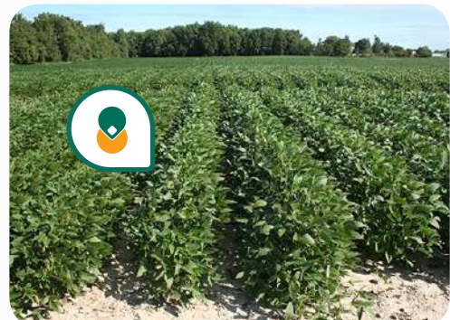
AZteroid FC 3.3 and starter fertilizer in-furrow application